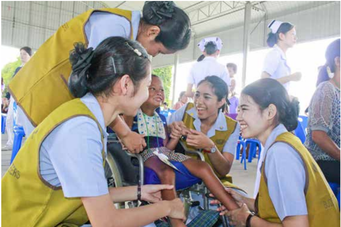
Students from Boromarajonani College of Nursing, Changwat Nonthaburi, cared for a child with learning disabilities and brought forth a big smile.

ophthalmology and dentistry, new services such as acupuncture and ENT (ear, nose and throat) were added to provide a wider variety of diagnosis and therapies.