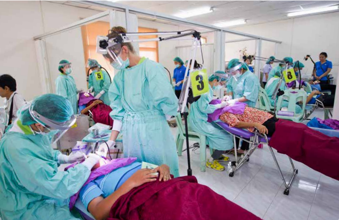
Dentists are primarily from Lamar Hospital. To reduce the waiting time under the glaring sun, there are fourteen dental chairs in operation simultaneously.